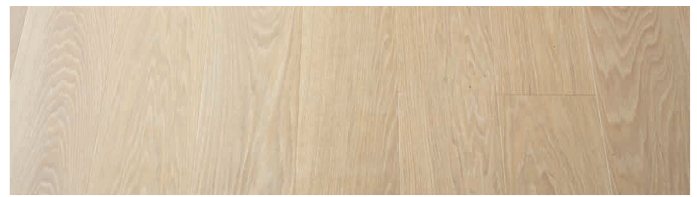
Reducing the risk of overlap marks.